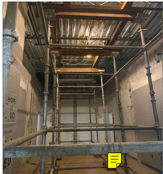
Structural shoring has begun in area 2