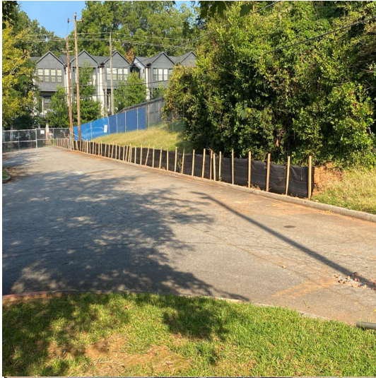
Began installing erosion control silk fence