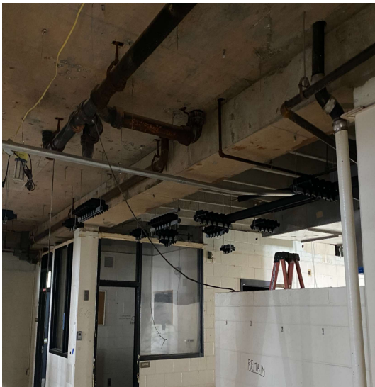
Began installing racks in the kitchen area