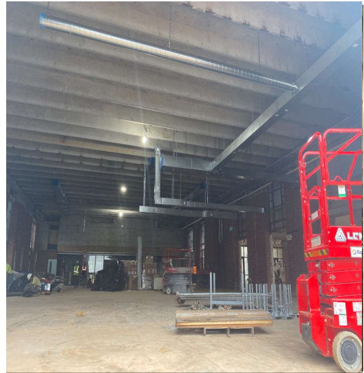
Continue installing duct in the cafeteria.